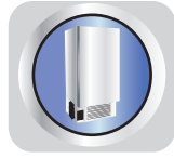
PROTECT VALUABLE ASSETS