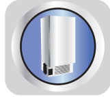
PROTECT VALUABLE ASSETS