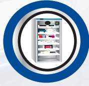
PROTECT VALUABLE ASSETS