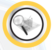
GRAPH OF EVENTS